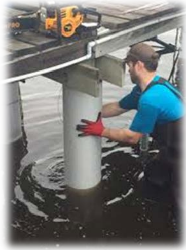
Figure 6 SnapJacket™ Installation during Restoration of Damaged Marine Piling

New barrier systems (Durosleeve™ and SnapJacket™) made from very safe, durable, and proven PVC compounds can be applied to new or existing pilings, poles and various other products utilized in marine construction. These robust products can protect new piling from MWDOs and can be utilized to restore and provide future protection for in-place piling.