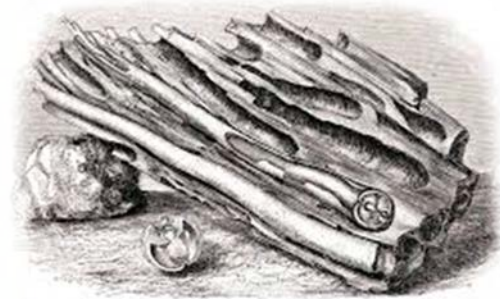
Figure 1 Shipworms accessed from Google Photos 2-2017

MWDOs are defined and classified into two groups. The first group is Mollusks that contains what are commonly referred to as “Shipworms” and “Boring Clams”.