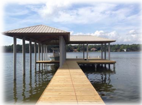
Figure 7 Durosleeve™ Installation on a New Dock in South Alabama