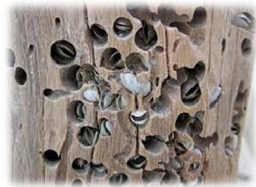
Figure 3 Boring Clams

attacking creosote timbers, concrete, and even the lead sheathing of underwater cables.