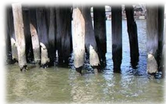
Figure 4 Limnoria Damage

The second group of MWDOs is defined as Crustaceans. The three most common genera are Limnoria , Sphaeroma , and Chelura which are often grouped together and are known as "gribbles".