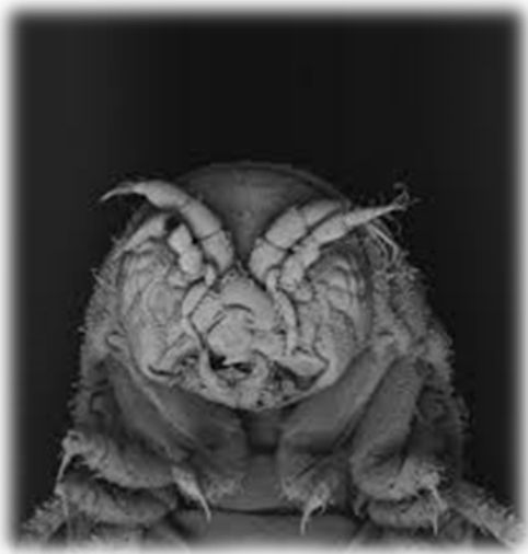
Figure 5 Limnoria "Wood Gribble" accessed Google Pictures 2-2017

Limnoria is the most important of the three in the United States and the free-swimming adults range from one-eighth to one-quarter inch in length. Limnoria burrow into the wood and can attack untreated, copper-containing (CCA), and creosote-treated piles and other wood components. The damage is not as extensive as the burrowing of shipworms, for instead of boring deeply into the wood the "gribbles" excavate galleries at or just under the surface at between the half and high-tide levels. This forms a honeycomb of burrows just under the surface of the wood, and water currents and tidal action gradually wear away these weak areas until piles gradually assume an "hour-glass" appearance at low tide. Limnoria migrate short distances from one wooden structure to another and the new location then becomes a breeding site.